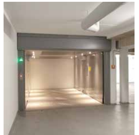
Rolling gate and traffic lights in a discreet appearance in the lower position.