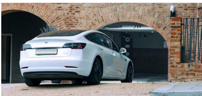
Fitzjohn Ave., London, UK, 29 spaces, residential