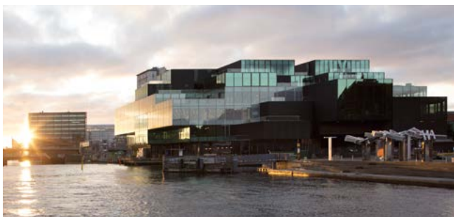
BLOX, Copenhagen, Denmark, 350 spaces, public