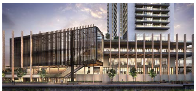
The Lennox, Sydney, Australia, 374 spaces, residential